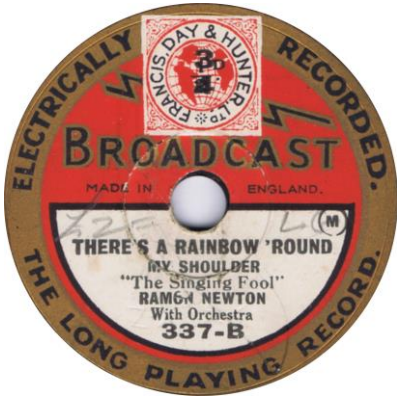
8" Broadcast 337, December 1928