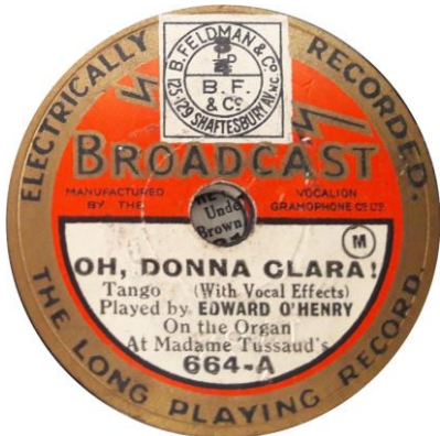
8" Broadcast 202, 1930