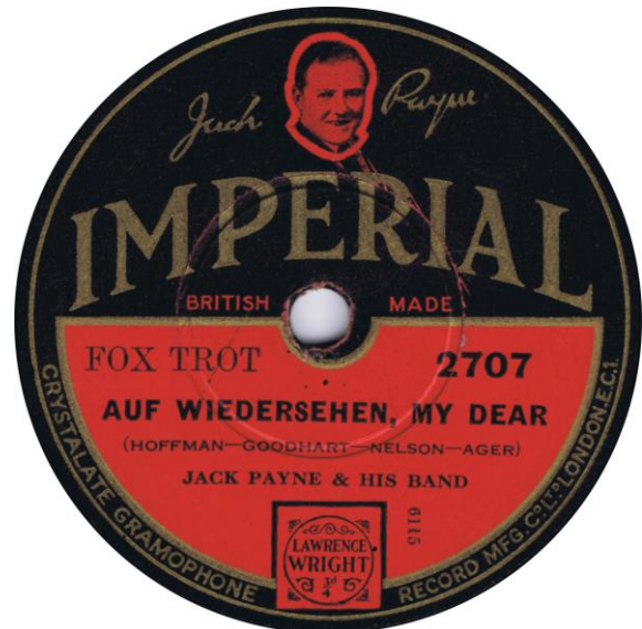
10" Imperial 2707, 1932