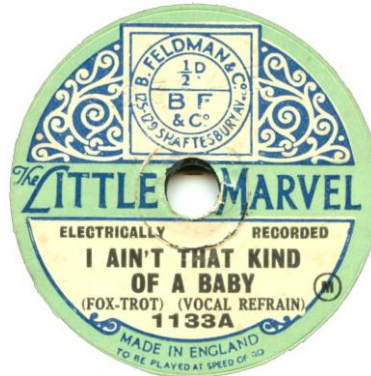
6" Little Marvel 1133, 1928