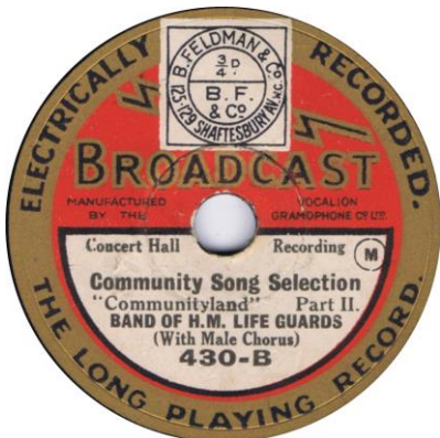
8" Broadcast 430, 1929