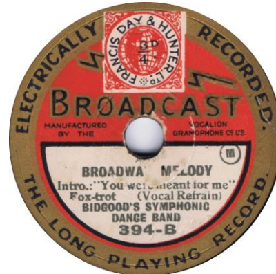
8" Broadcast 394, 1929