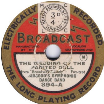
8" Broadcast 394, 1929