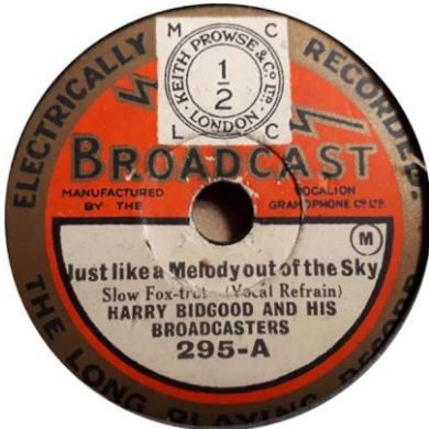
8" Broadcast 295, 1928