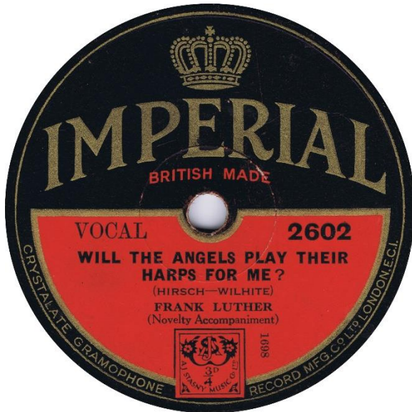
10" Imperial 2602, 1931