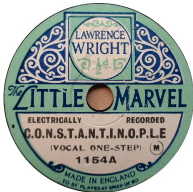
6" Little Marvel 1154, 1928