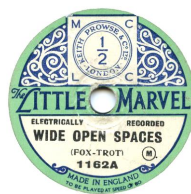
6" Little Marvel 1162, 1928