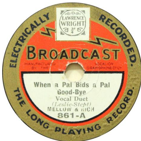
9" Broadcast 861, 1932