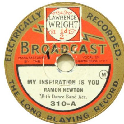
8" Broadcast 310, late 1928