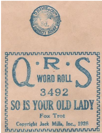
QRS (Australia) Word Roll 3492, 1926