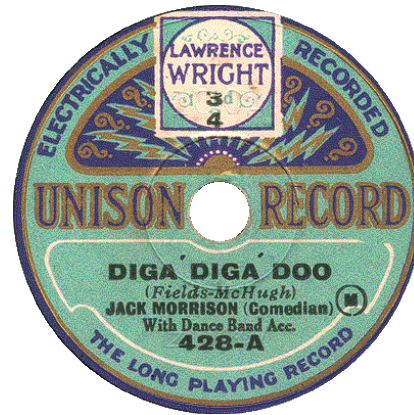
8" Unison 428, 1929