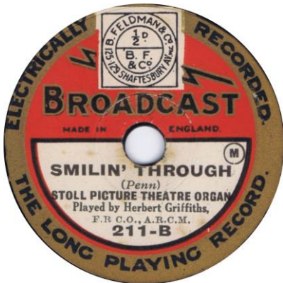
8" Broadcast 220, 1928