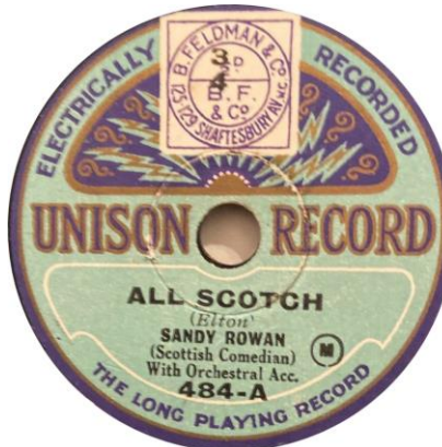
8" Unison 484, 1929