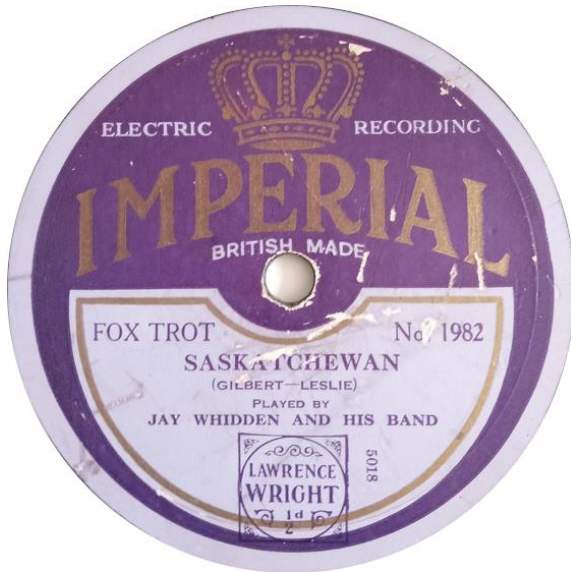
10" Imperial 1982, 1928