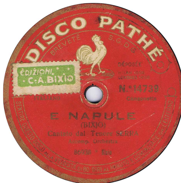
Disco Pathe 14739, Italy, late 1920s. E Napule (Bixio)