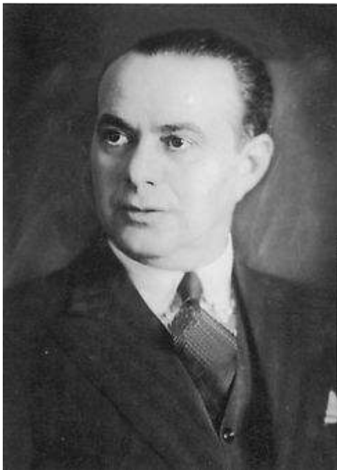
Abraham Tuschinski, 1886-1942