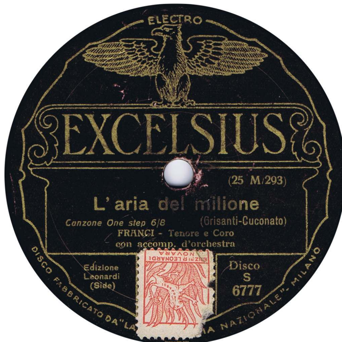
Excelsius S6777, Italy, late 1920s

This is notably smaller than the previously catalogued type 1.