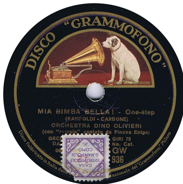
Disco Grammofono GW936 Mia Bimba Bella c.1935, composers Rampoldi & Carbone

( ) green, signature hand-stamped in violet c.1935 Perf 11½