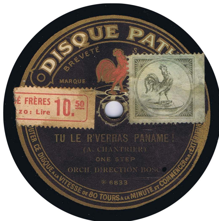
Disque Pathé 6833, France, 1921.