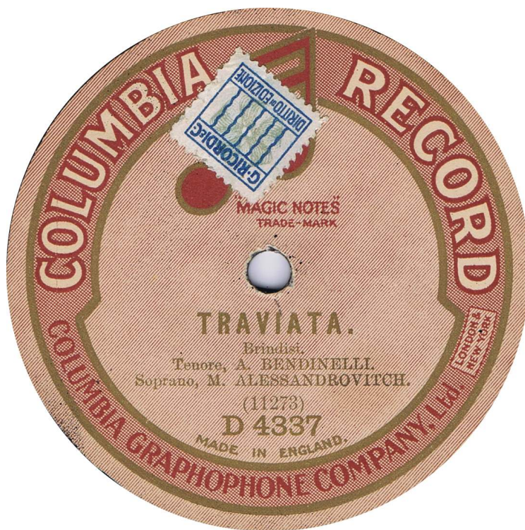
Columbia D4337, England, pre-WW1

1¼d rose, black 1920s, ex KRISTALL record Perf unknown. A curious mix of French text and British currency.